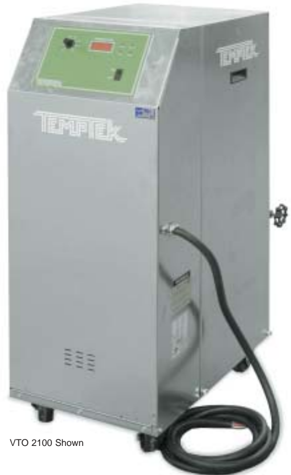
VTO 2100 Shown