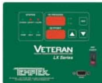
New VT instrument