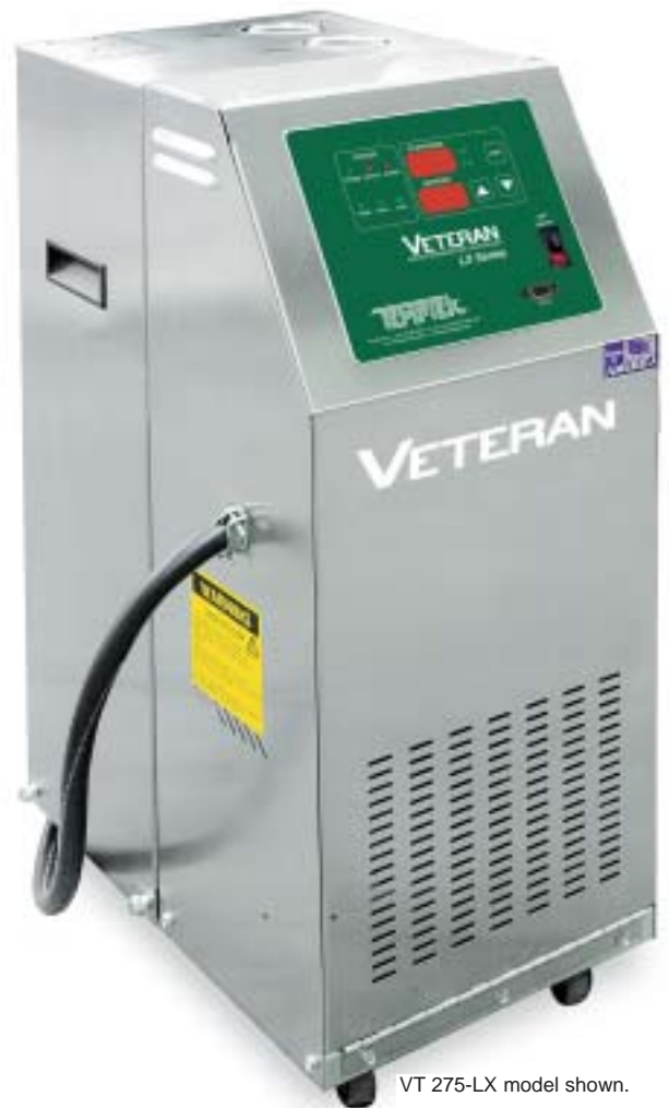
VT 275-LX model shown.

Quantity and cash discounts are offered. Call your dealer or the factory for discount plans.