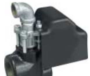
New modulating cooling valve

PRICE & PERFORMANCE... for the LONG TERM