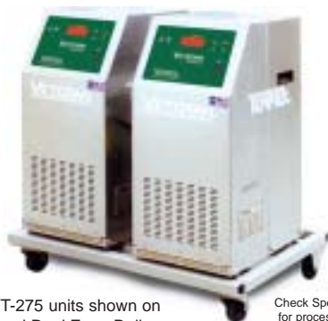
Two VT-275 units shown on Optional Dual Zone Dolly

Check Specifications Sheet #93 for process connection details.