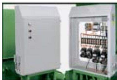
Optional system control console.