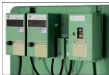
Starters shown mounted & wired.

Starters, valves, and thermostats are supplied as components and shipped loose for field installation with drawings supplied to ease installation. Items can be sold as components to allow customizing systems to customer requirements. Also this makes changes to existing systems a simple process.