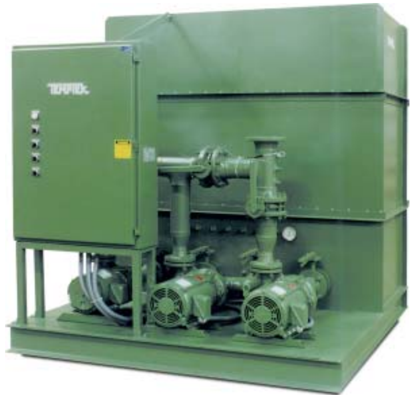
PT-750 shown with 3 pump manifold (process, reciprocation and standby). Model shown complete with the following options: valves mounted with discharge manifold, prewired system cabinet.