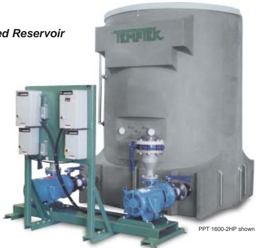
PPT 1600-2HP shown

Model shown with pumps, valves, and motor starter all mounted and wired.