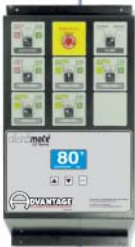
CheckMate™ Display Panel