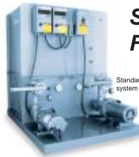
Standard 2 pump system shown.

Note: the Central Control Console option must be purchased to accommodate the pressure and temperature alarm system option, the electronic water make-up system option and the Checkmate™ control panel option.