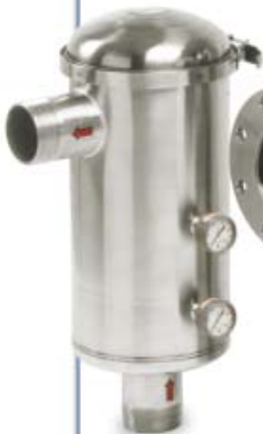
MLS-3 with optional pressure gauges