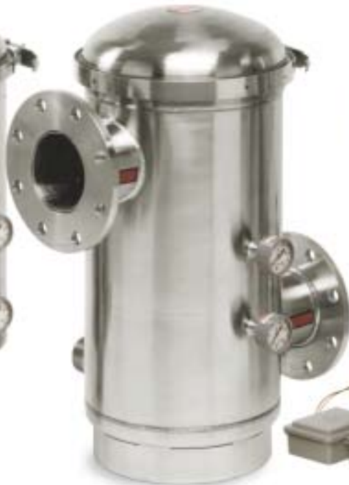
MLS-4 with optional pressure gauges