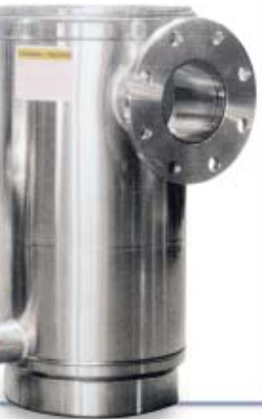
Conical filter removed from shell.