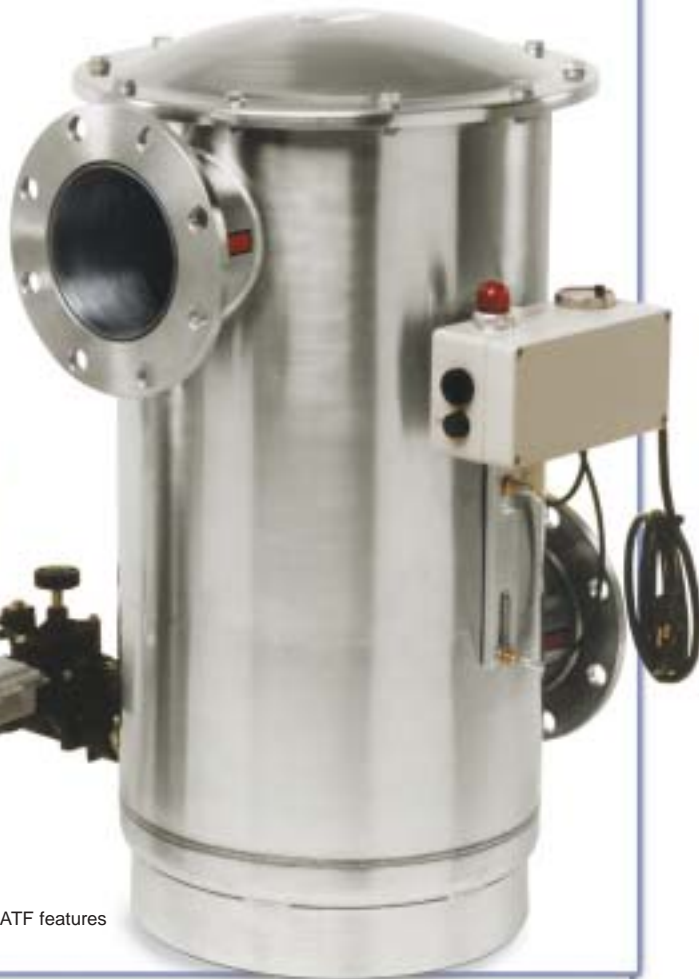
MLS-6 with optional PDA and ATF features