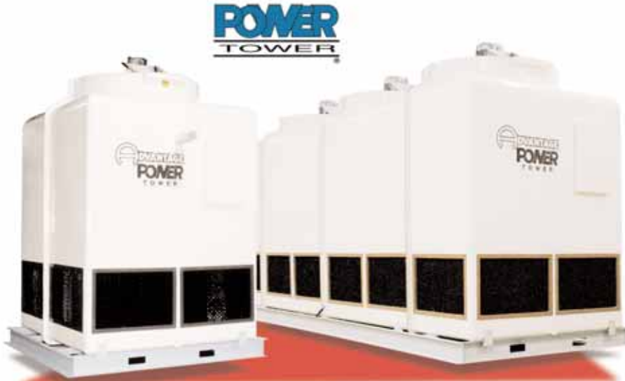
TC-135F: 135 ton fiberglass tower cell