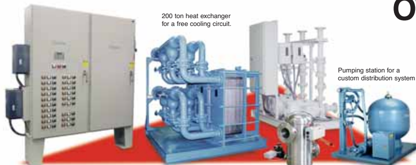
Control Station with individual operators for a custom 800 ton central chilling and tower system.