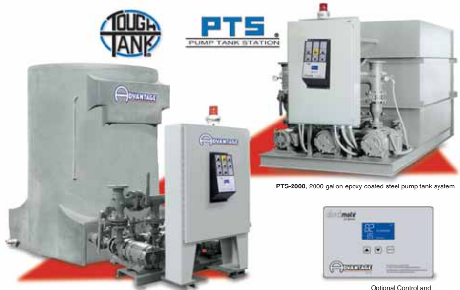
PTS-2000, 2000 gallon epoxy coated steel pump tank system

PUMPING SYSTEMS are part of ADVANTAGE Pump Tank Stations. Heavy-duty centrifugal pumps specifically selected for the application provide the required flow and pressure to each use point in the system. Systems are configured with process pump or process and recirculating pump with optional standby. Systems can be equipped with full electrical starting, monitoring and diagnostic components including variable speed drive systems that maintain constant fluid flow and pressure.